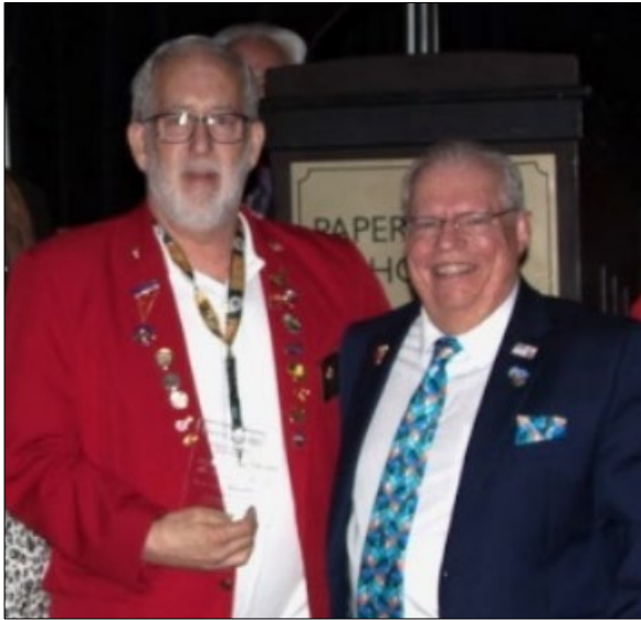
Lodge of the year Watertown 666