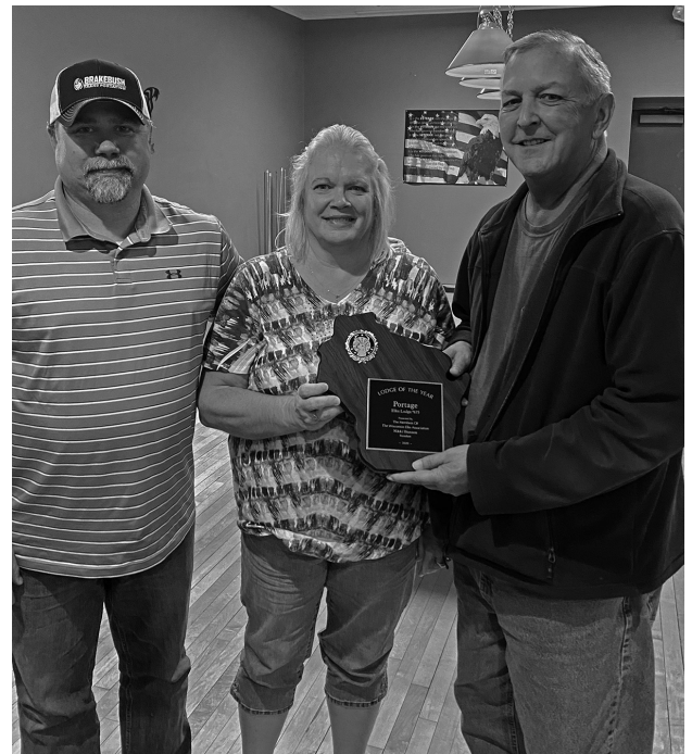
Portage Lodge #675 Lodge of the Year