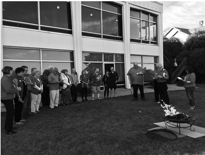
MEMBERS OF MADISON LODGE #410 WATCH THE BURNING OF THE MORTGAGE

A very exciting Mortgage Burning Ritual was held at Madison Elks Lodge #410 was performed at our State President's visit on September 30, 2017. It was so rewarding to pay off the mortgage on our building and be able to share the ritual with our State leaders. The following pictures show the burning.