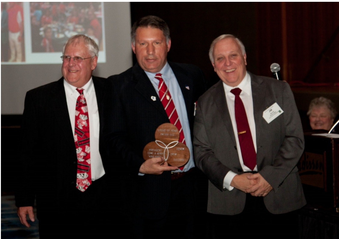
LODGE OF THE YEAR: ANTIGO ELKS LODGE #662