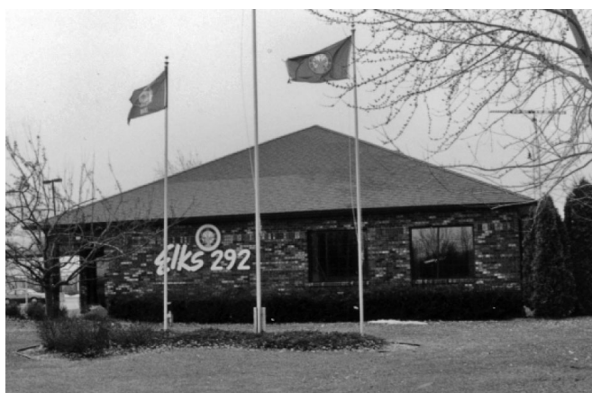
Oshkosh Lodge #292 received the Lodge of the Year Award.