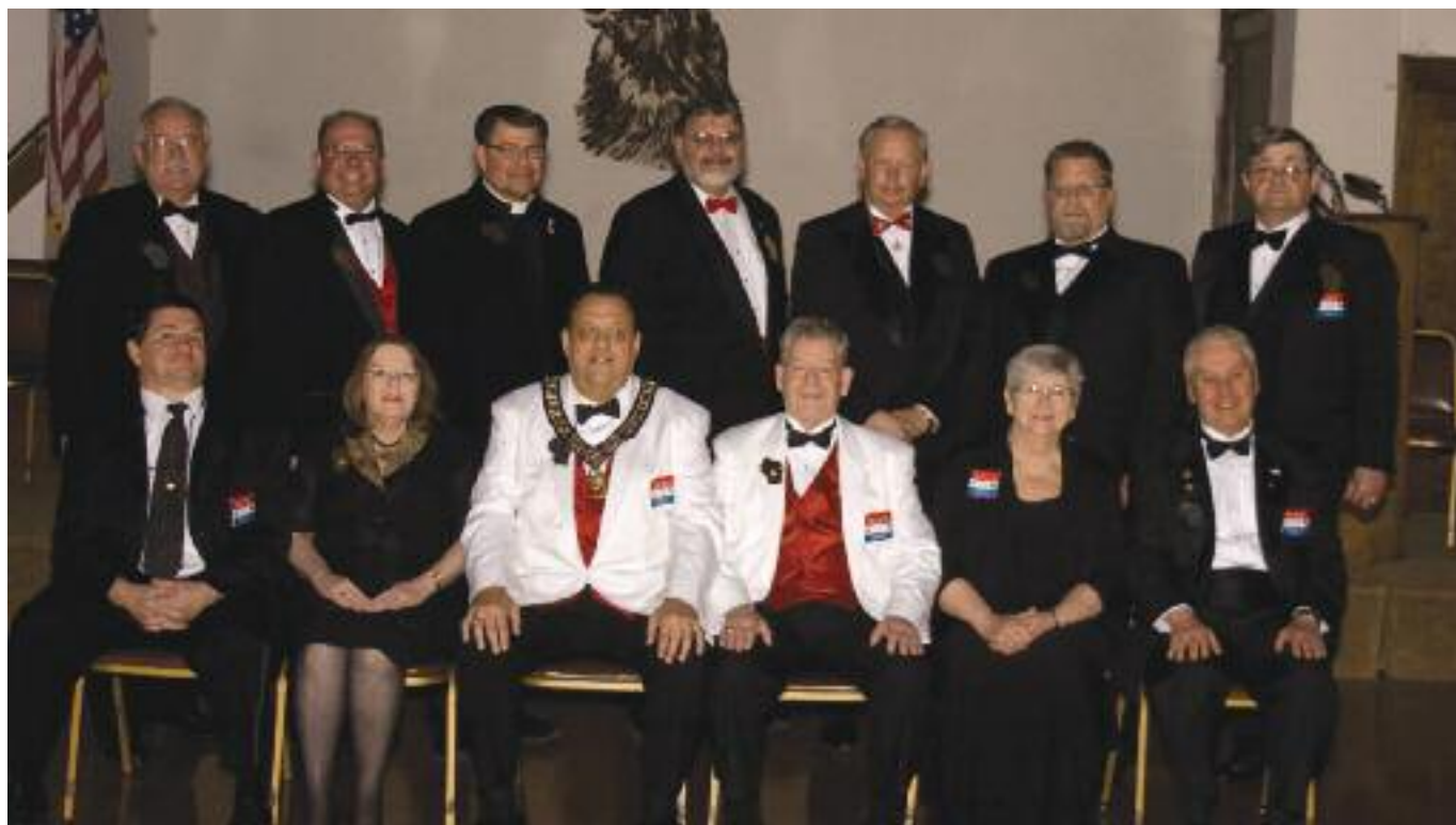
THE 2011-2012 WISCONSIN ELKS ASSOCIATION STATE OFFICERS

Wisconsin Elks Association WEBPAGE: www.wielks.org